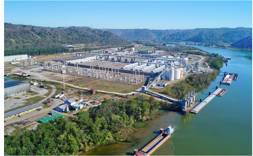
Long Ridge Energy Terminal